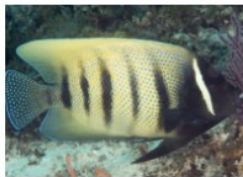
Orpheus Island - Citizen science iNaturalist project