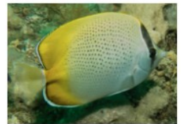
Wonder Reef (Gold Coast) - Citizen science iNaturalist project