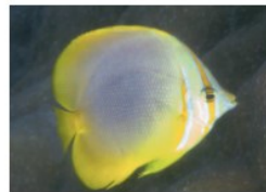
Magnetic Island - Citizen science iNaturalist project