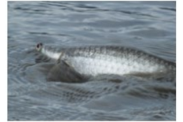
Koinmerburra Ridge to Reef project - Citizen science iNaturalist project