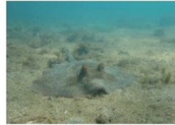
Sharks and Rays of Queensland - Citizen science iNaturalist project